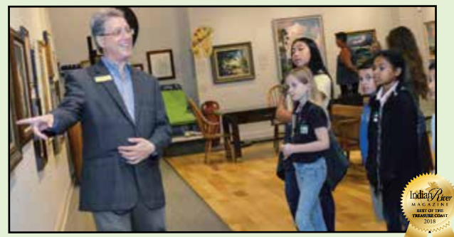
Named Best Museum 2018